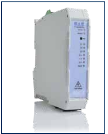
PM-1: Power measurement module for recording relevant network variables in low and medium voltage systems