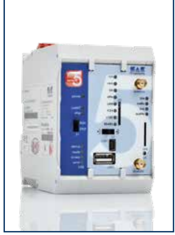
SAE-FW-5-GATE-4G: Powerful / LTE modem.